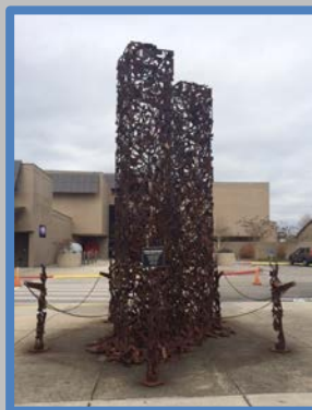
Sculpture made of metal from the fallen Twin Towers