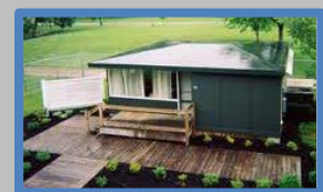
Flat Top House Today

you will learn something that you didn't know about the "Secret City." ■