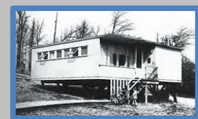
Flat Top House in 1940

If you are in Oak Ridge, it is worth the time and $5 admission fee to visit this museum; we are sure